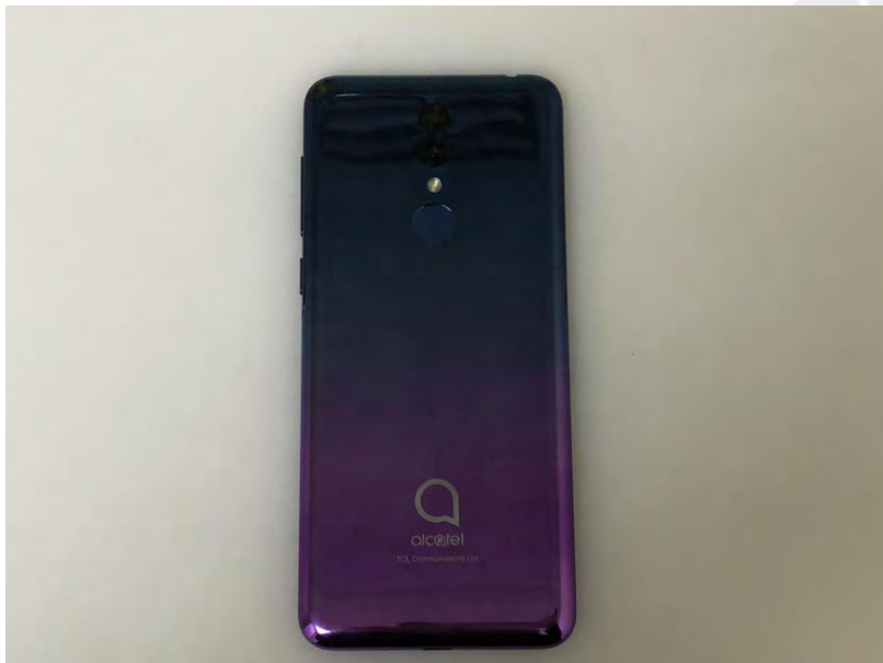
Fig. 4 Back view of EUT