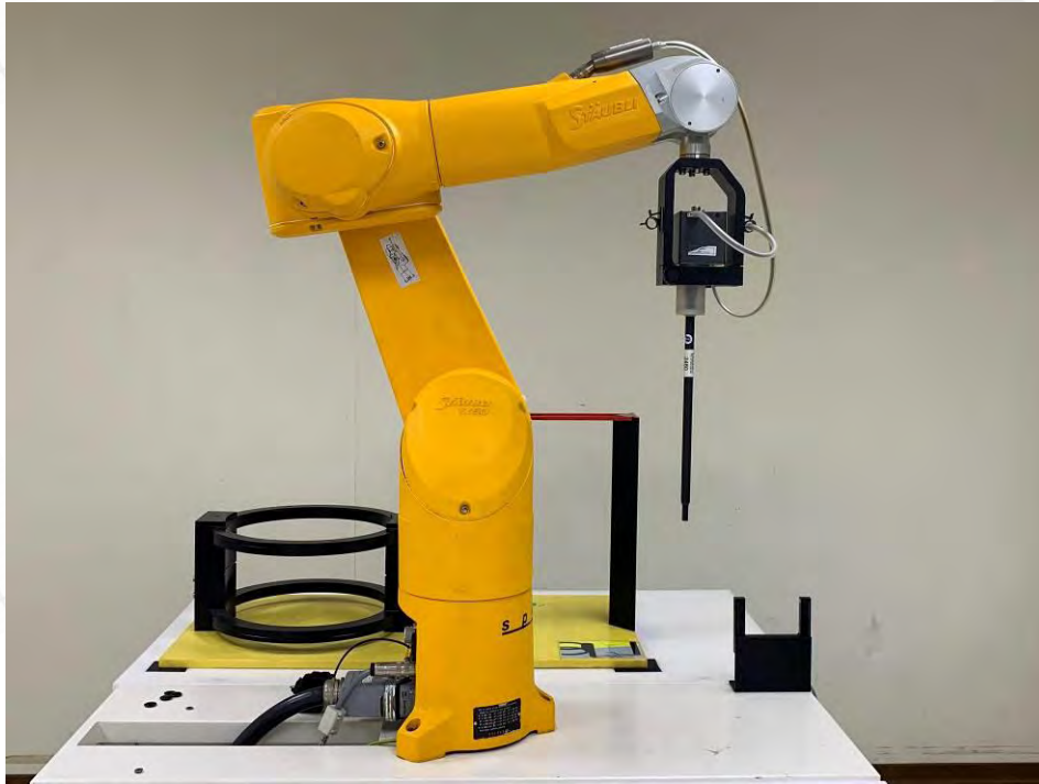
Fig. 1 Photograph of the DASY 5 measurement system