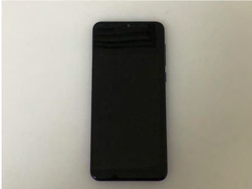
Fig. 3 Front view of EUT