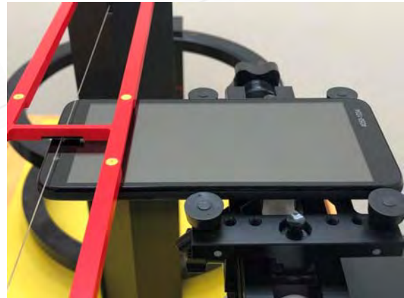
Fig. 2 Receiver of mobile contact center of Arch

Unless otherwise stated the results shown in this test report refer only to the sample(s) tested and such sample(s) are retained for 90 days only. 除非另有說明，此報告結果僅對測試之樣品負責，同時此樣品僅保留90天。本報告未經本公司書面許可，不可部份複製。