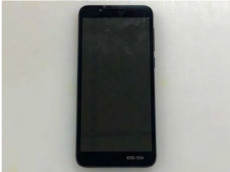
Fig. 3 Front view of EUT