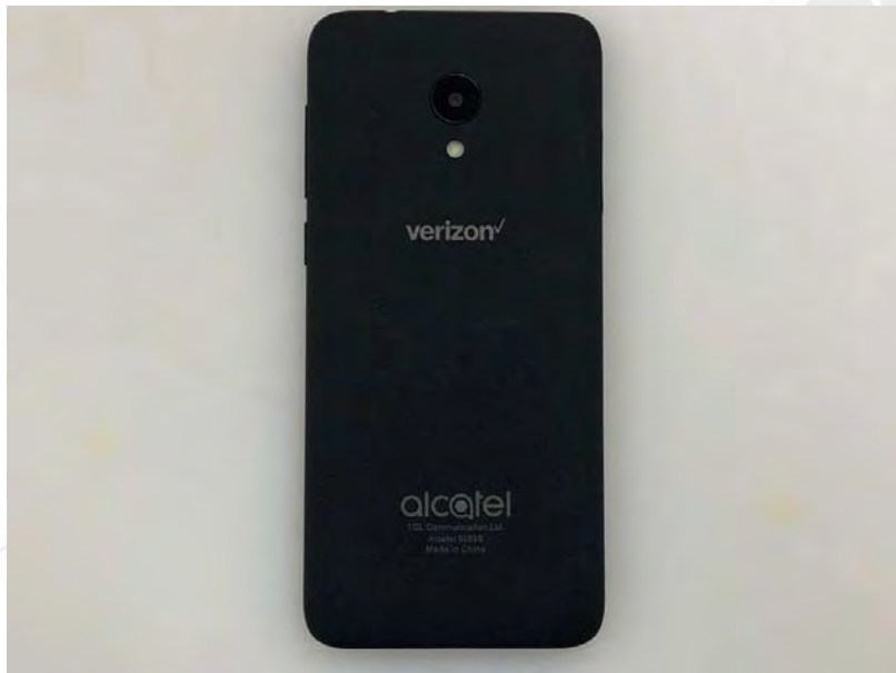
Fig. 4 Back view of EUT