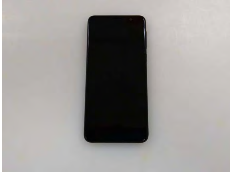
Fig. 3 Front view of EUT