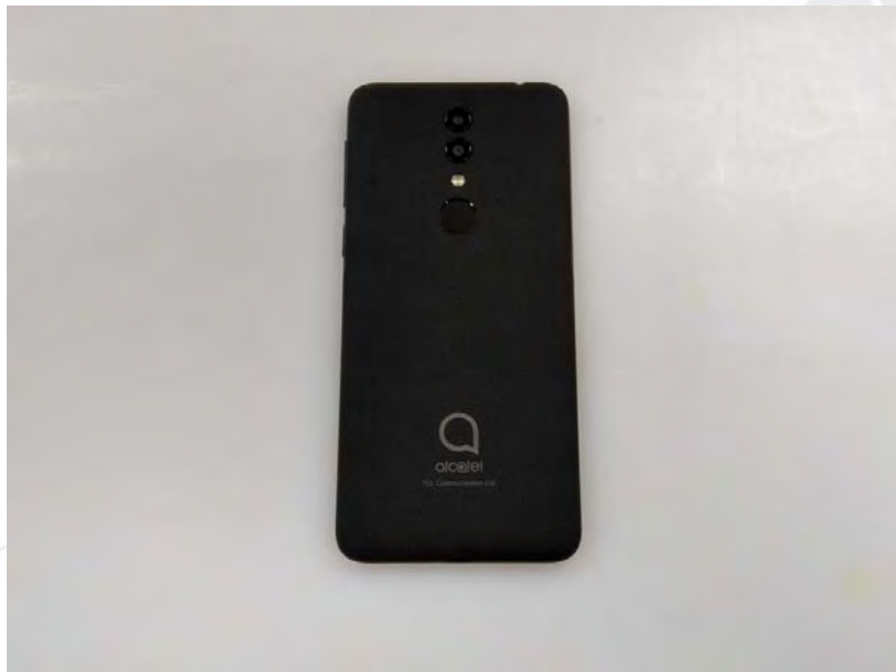
Fig. 4 Back view of EUT