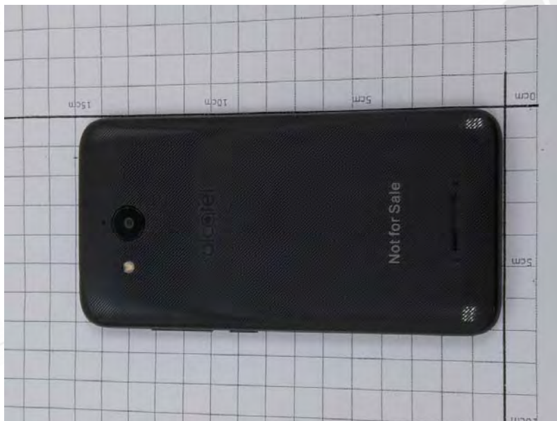
Fig. 4 Back view of EUT