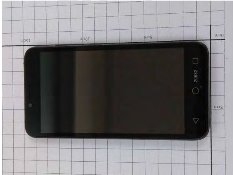
Fig. 3 Front view of EUT