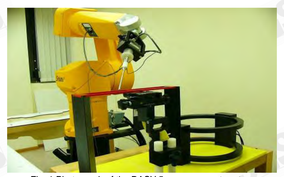
Fig. 1 Photograph of the DASY 5 measurement system