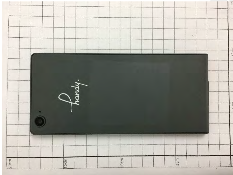
Fig. 4 Back view of EUT