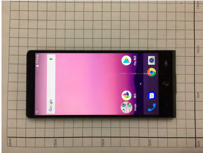
Fig. 3 Front view of EUT