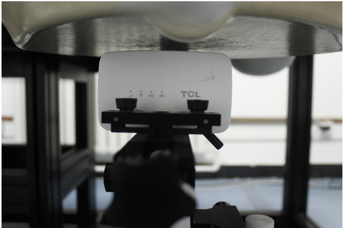
Picture7: Top 10mm