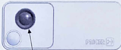
Small lens diameter

Depending on optical lens system the lens window diameter is either small or large as shown on the pictures below: