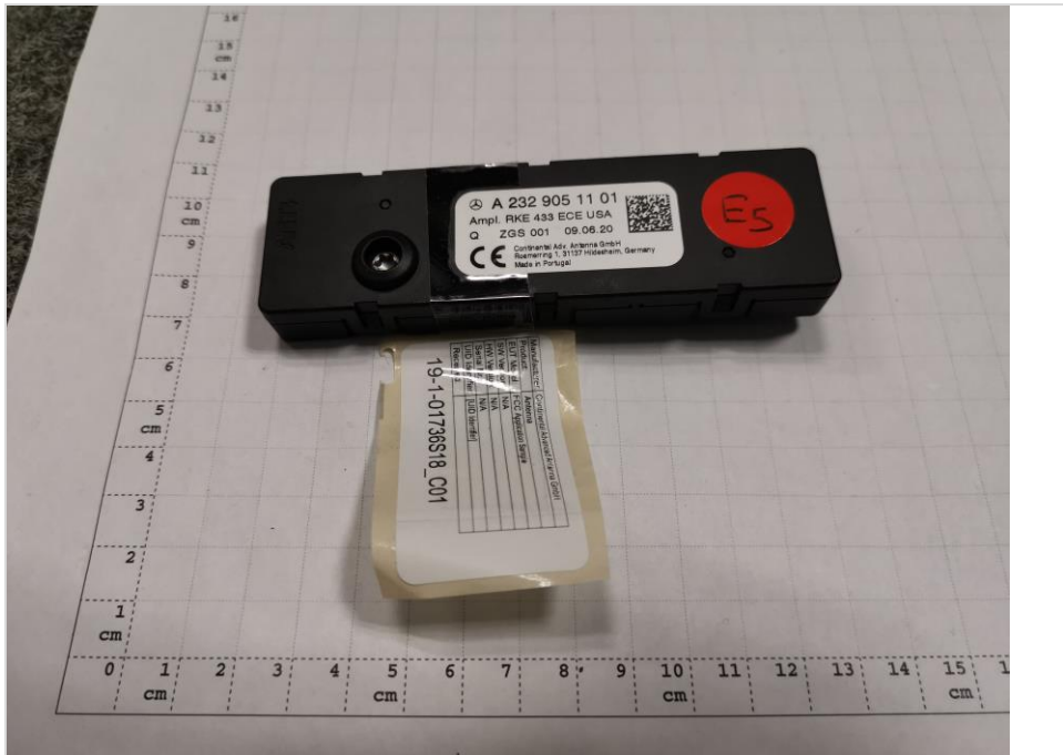
Photograph 1: EUT 1_Front view