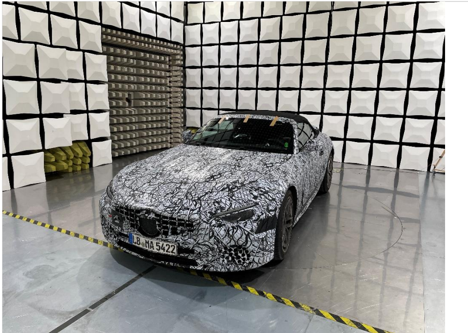
Photograph 5: AE 2 Front view