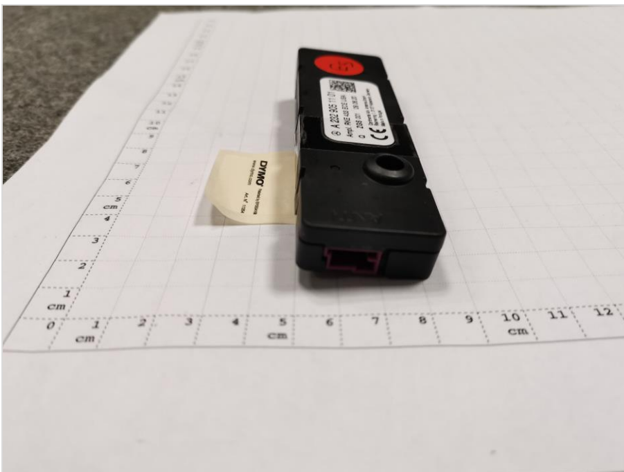
Photograph 4: EUT 1_Right side view