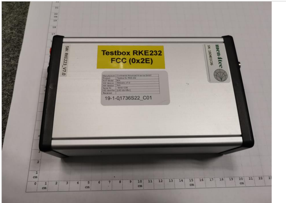
Photograph 1: AE 1 top side view