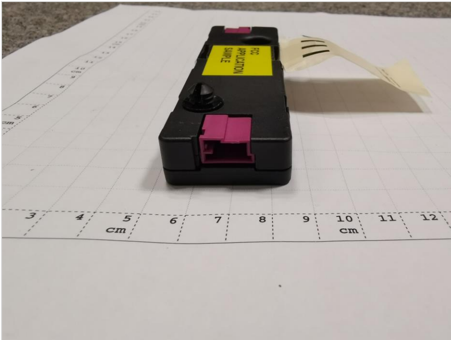
Photograph 3: EUT 1_Left side view