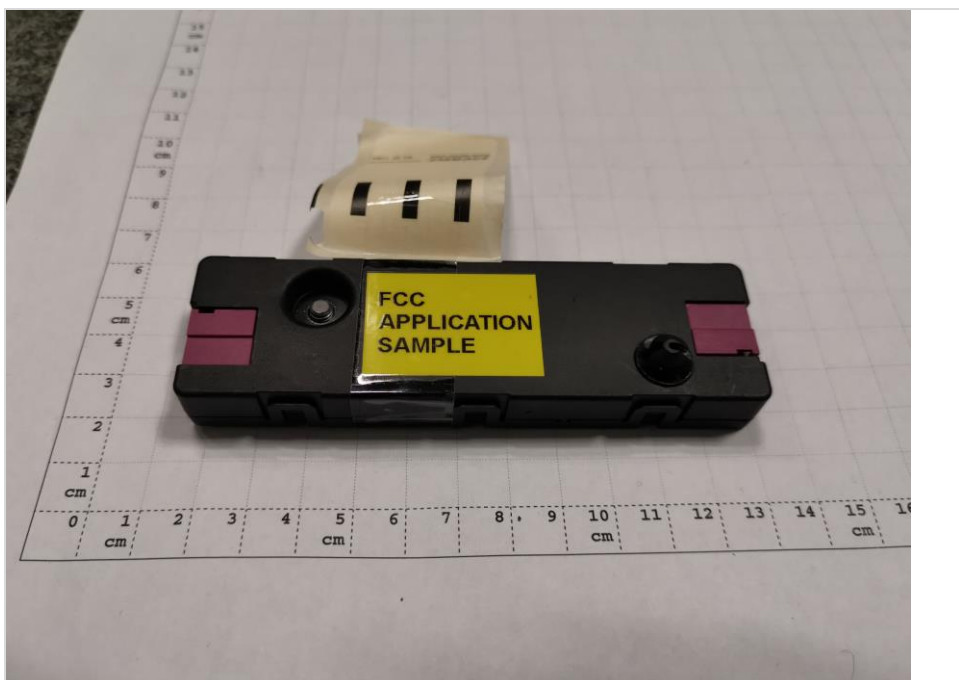
Photograph 2: EUT 1_Rear view