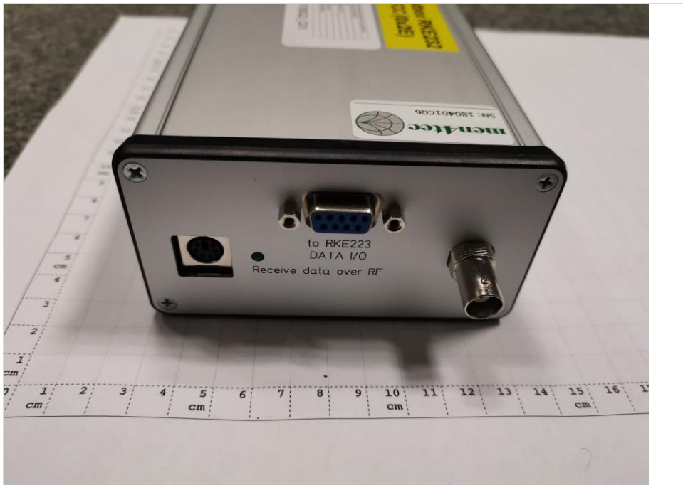
Photograph 3: AE 1 Rear view