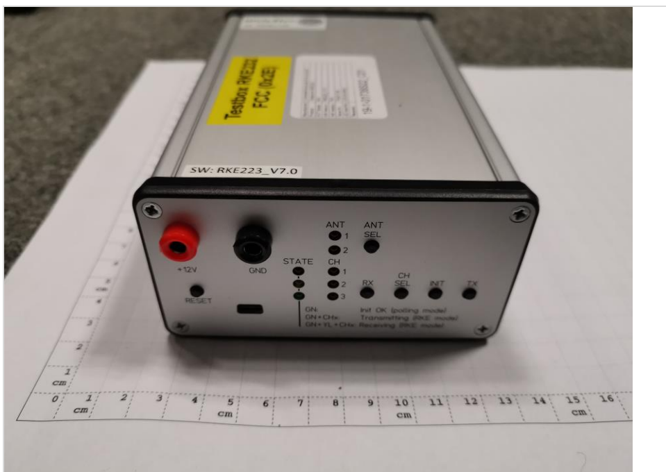
Photograph 2: AE 1 Front view