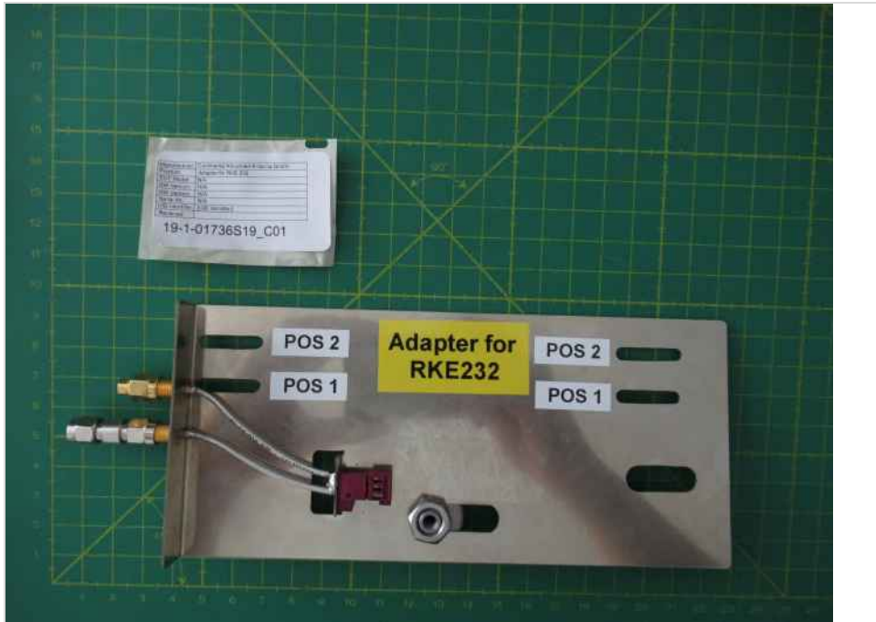
Photograph 5: AE3