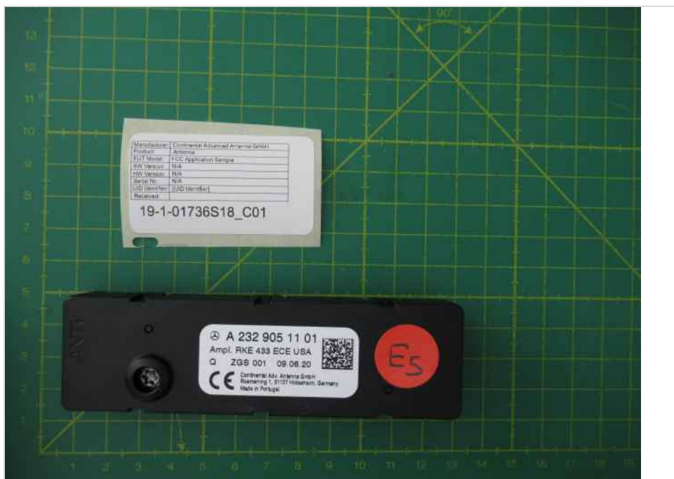
Photograph 2: EUT 1_Rear side view