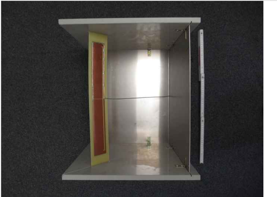
Photograph 3: AE1