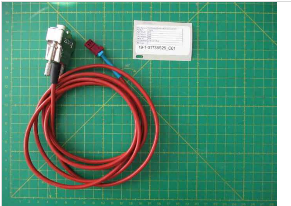
Photograph 6: AE1