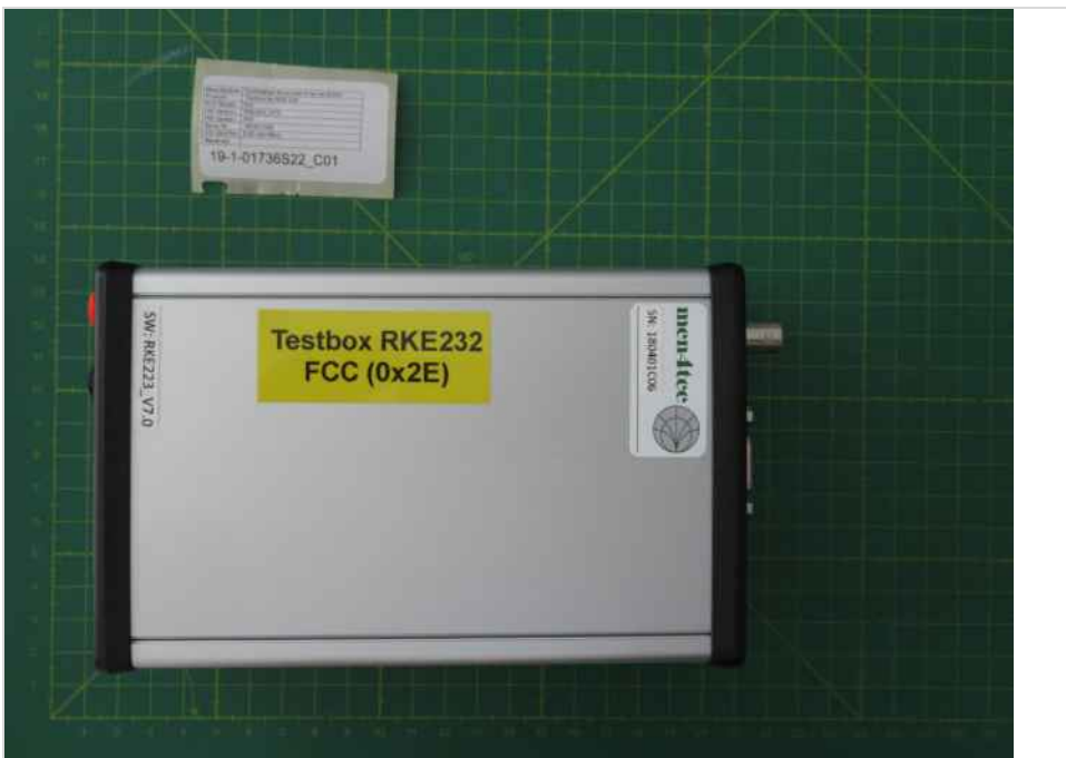
Photograph 4: AE2