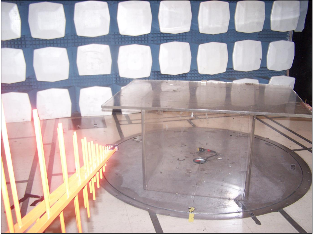
Photograph 1. Radiated Emissions, Test Setup