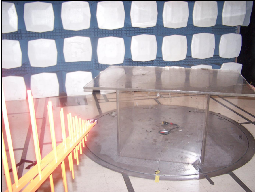
Photograph 2. Radiated Spurious Emissions, Test Setup, 30 MHz – 1 GHz