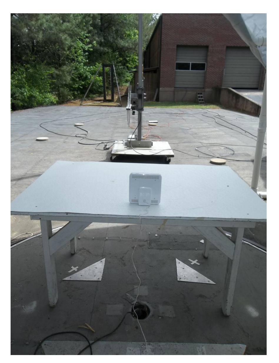
Figure 5. Radiated Emissions Test Setup (200-1000 MHz)