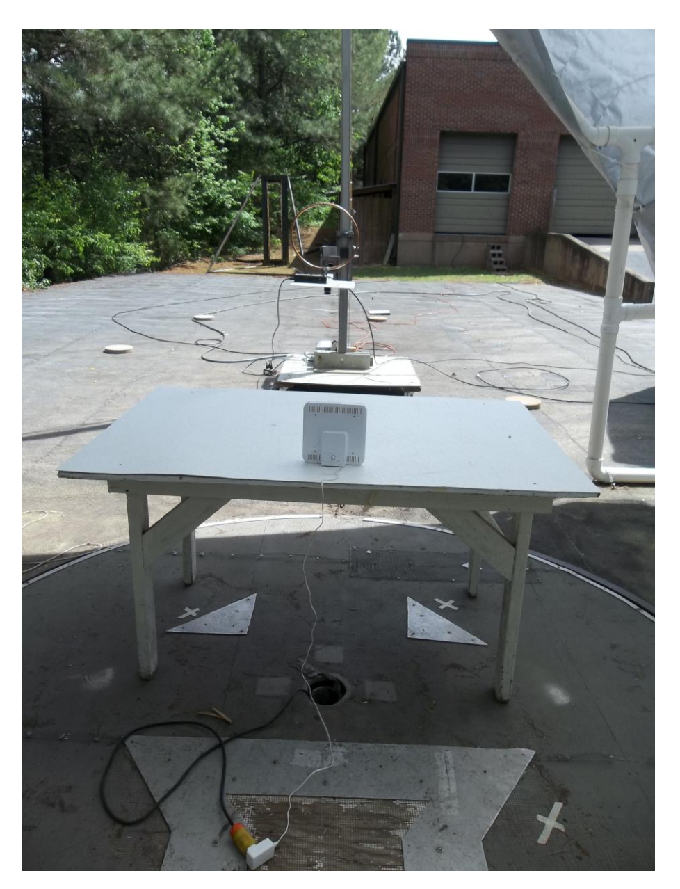
Figure 6. Radiated Emissions Test Setup (Below 30 MHz)