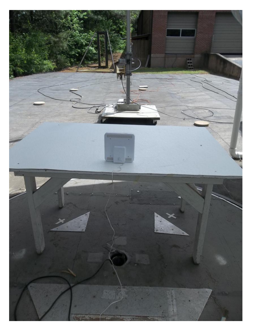
Figure 3. Radiated Emissions Test Set Up (Above 1 GHz)

FCC P15.247 2ACAJ-WINK22 14-0075 May 13, 2014 WINK Inc. Hub