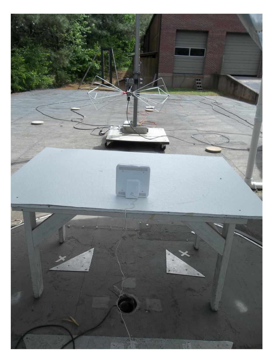
Figure 4. Radiated Emissions Test Setup (30-200 MHz)