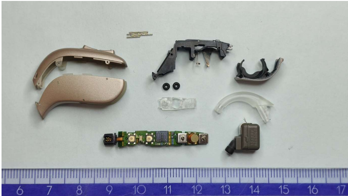
PCB showing the connector side

For HW version: 229290 rev.00 under the Medical Device Regulations