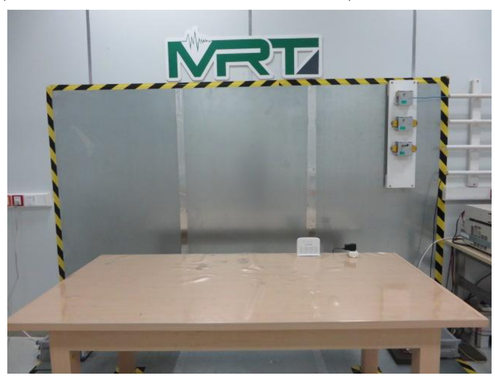
Description: Back View of the Conducted Emission Test Setup for 0.15 \text{kHz} \sim 30 \text{MHz}

Description: Front View of the Conducted Emission Test Setup for 0.15kHz ~ 30MHz