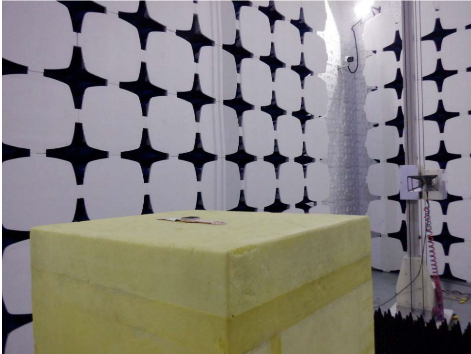
Radiated Spurious Emissions Below 1GHz