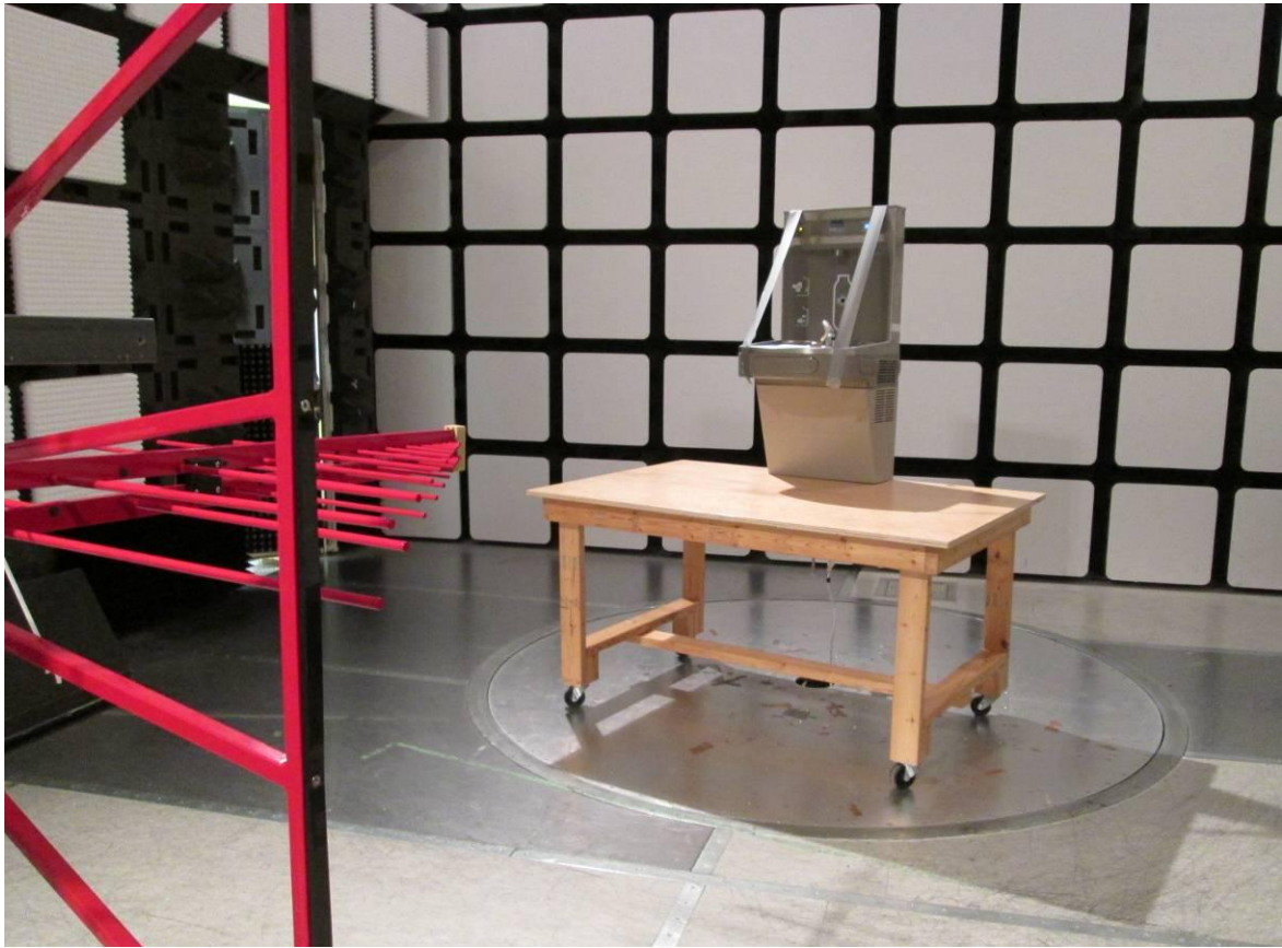
Photo 1. Radiated Emissions 1 Setup with Alpha-numeric Display connected. RF testing is similar.