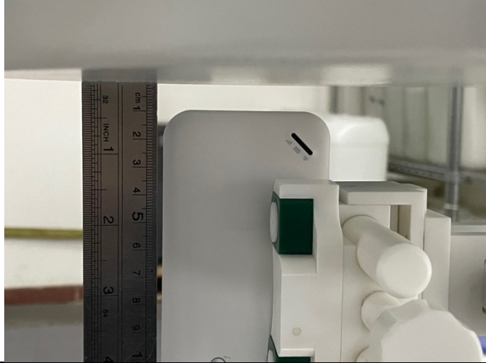
Top Side (Separation distance of 10mm)