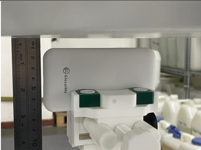
Left Side (Separation distance of 10mm)