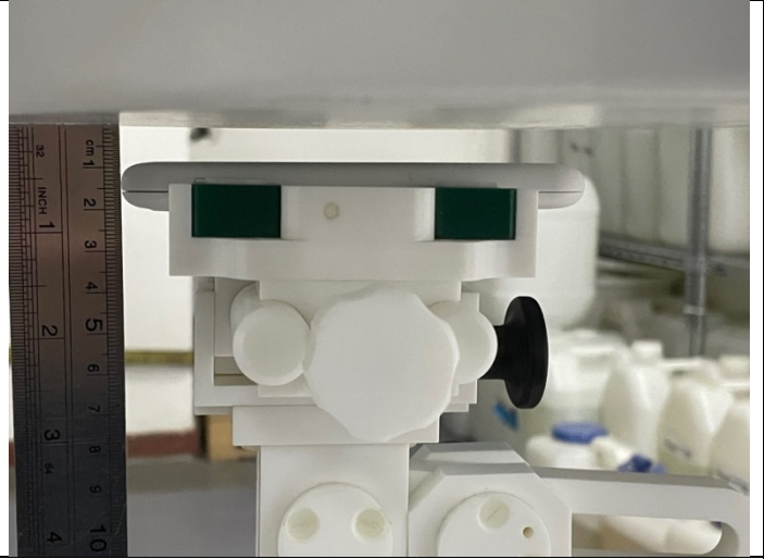
Back Side (Separation distance of 10mm)