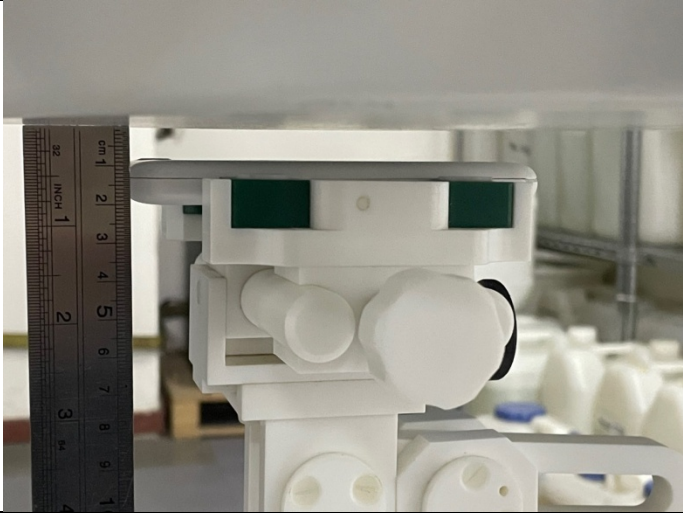
Front Side (Separation distance of 10mm)