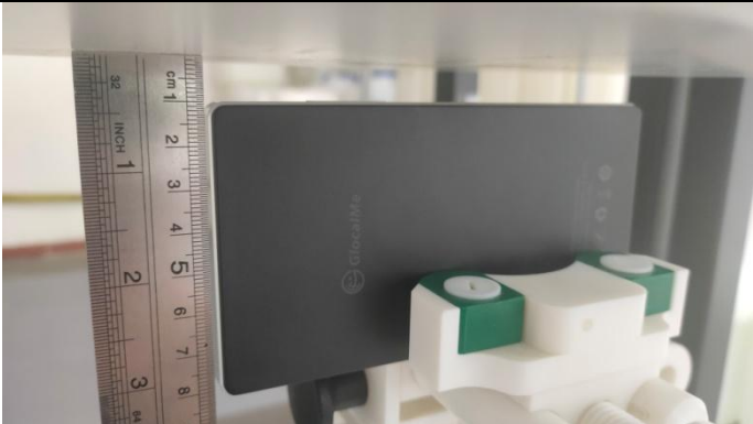
Left Side (Separation distance of 10mm)