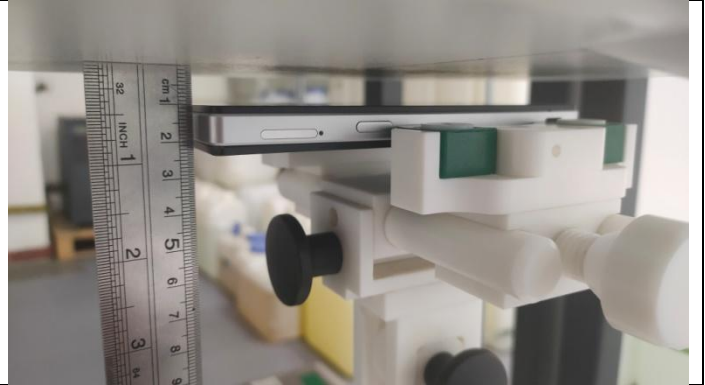
Back Side (Separation distance of 10mm)