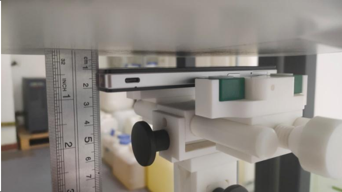
Front Side (Separation distance of 10mm)