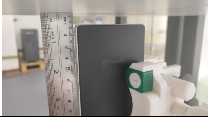
Top Side (Separation distance of 10mm)