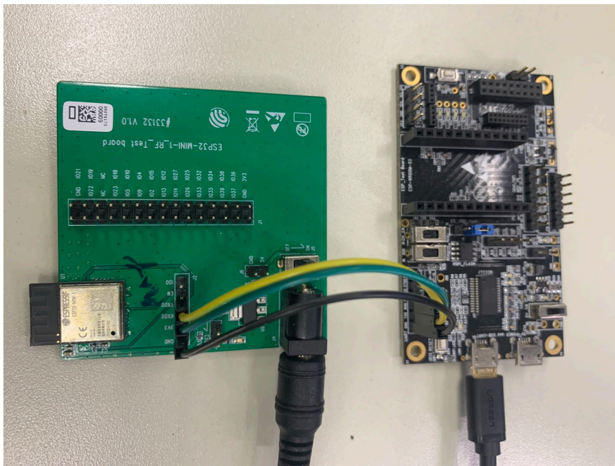
Figure 2: Hardware Connection