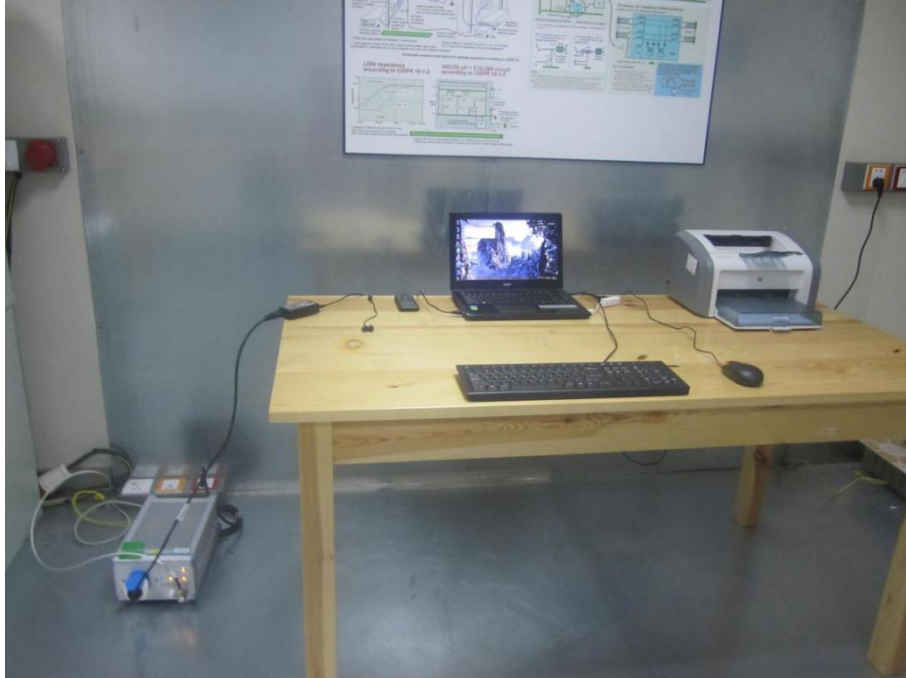
JBP radiation L