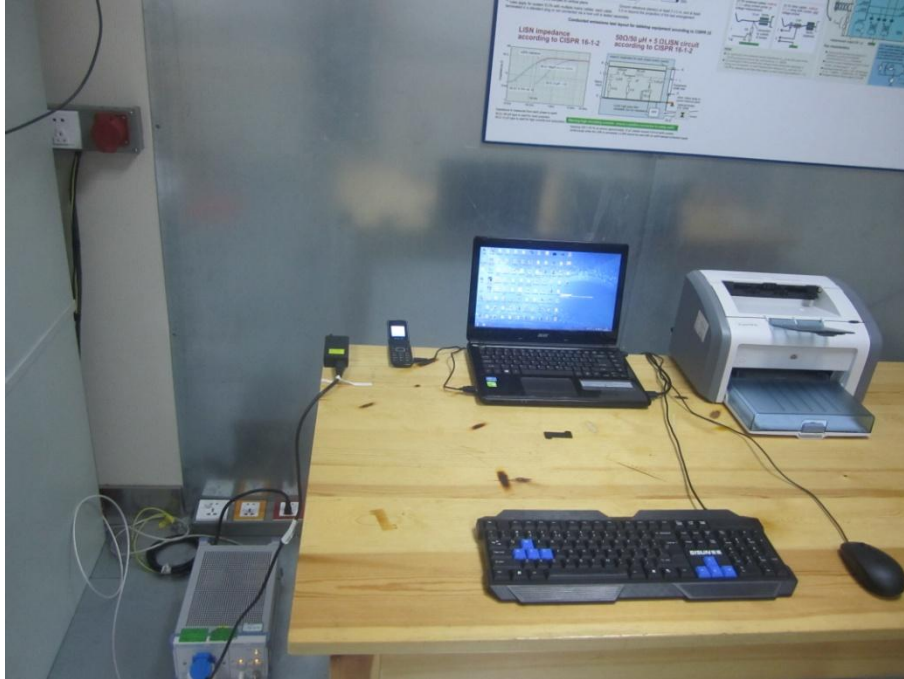
JBP radiation L