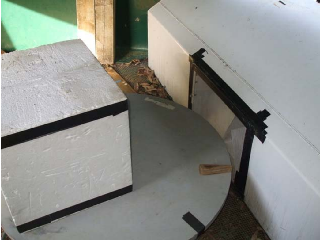
80 cm high test table

Inside the test enclosure showing the turntable and test table.