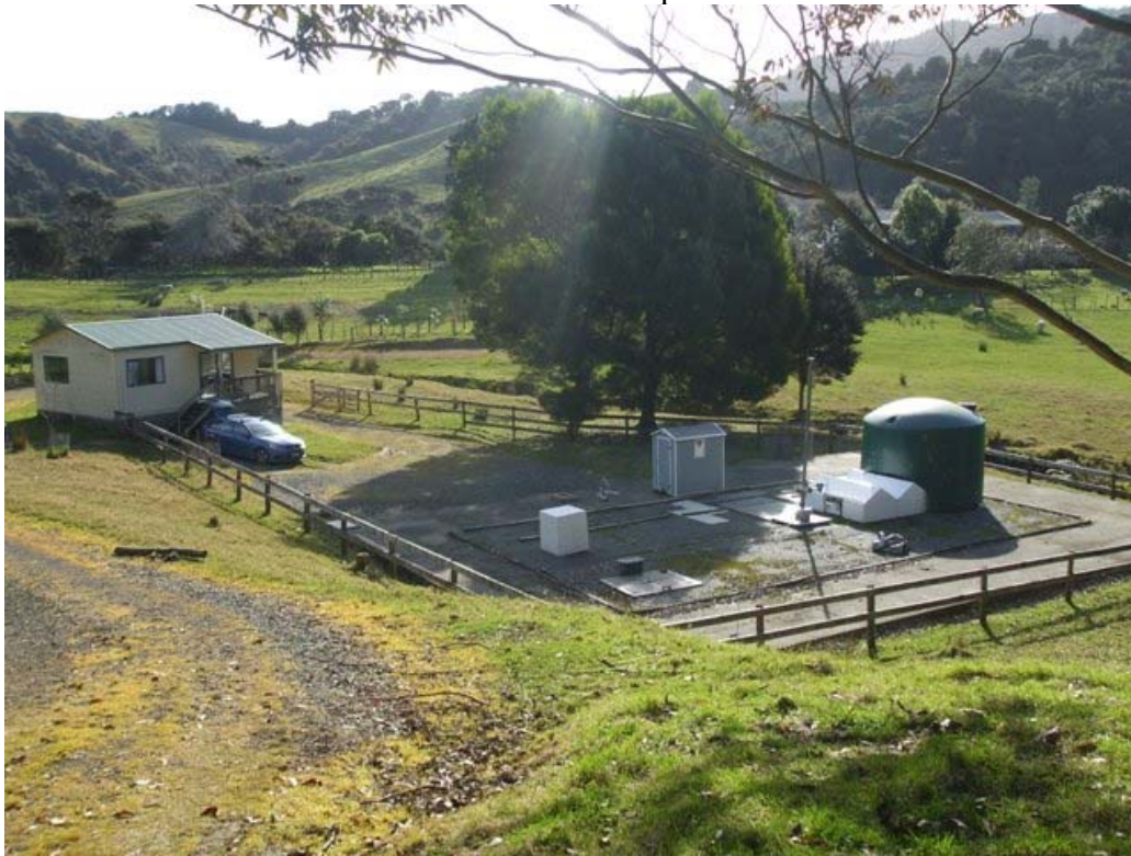
General Set Up