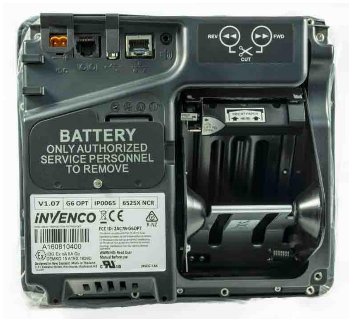
Figure 2 Assembled unit viewed from the back