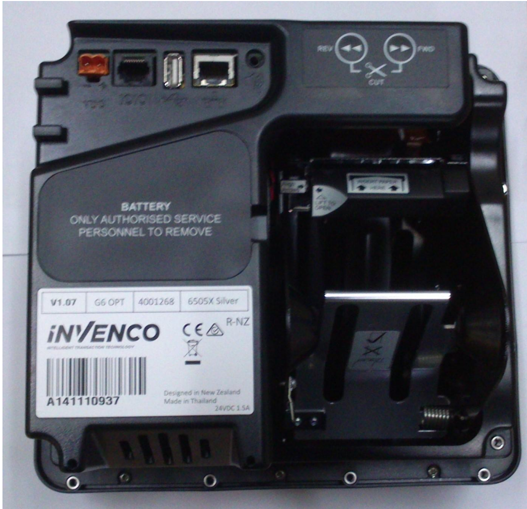
Assembled Unit from the Back