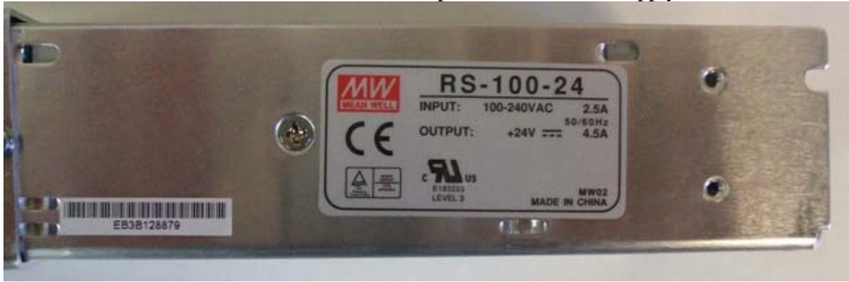
External Photos of the Representative Power Supply