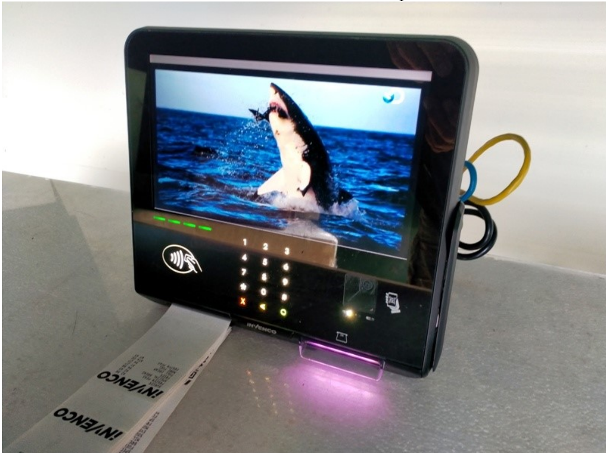
Radiated Emissions Test Set Up