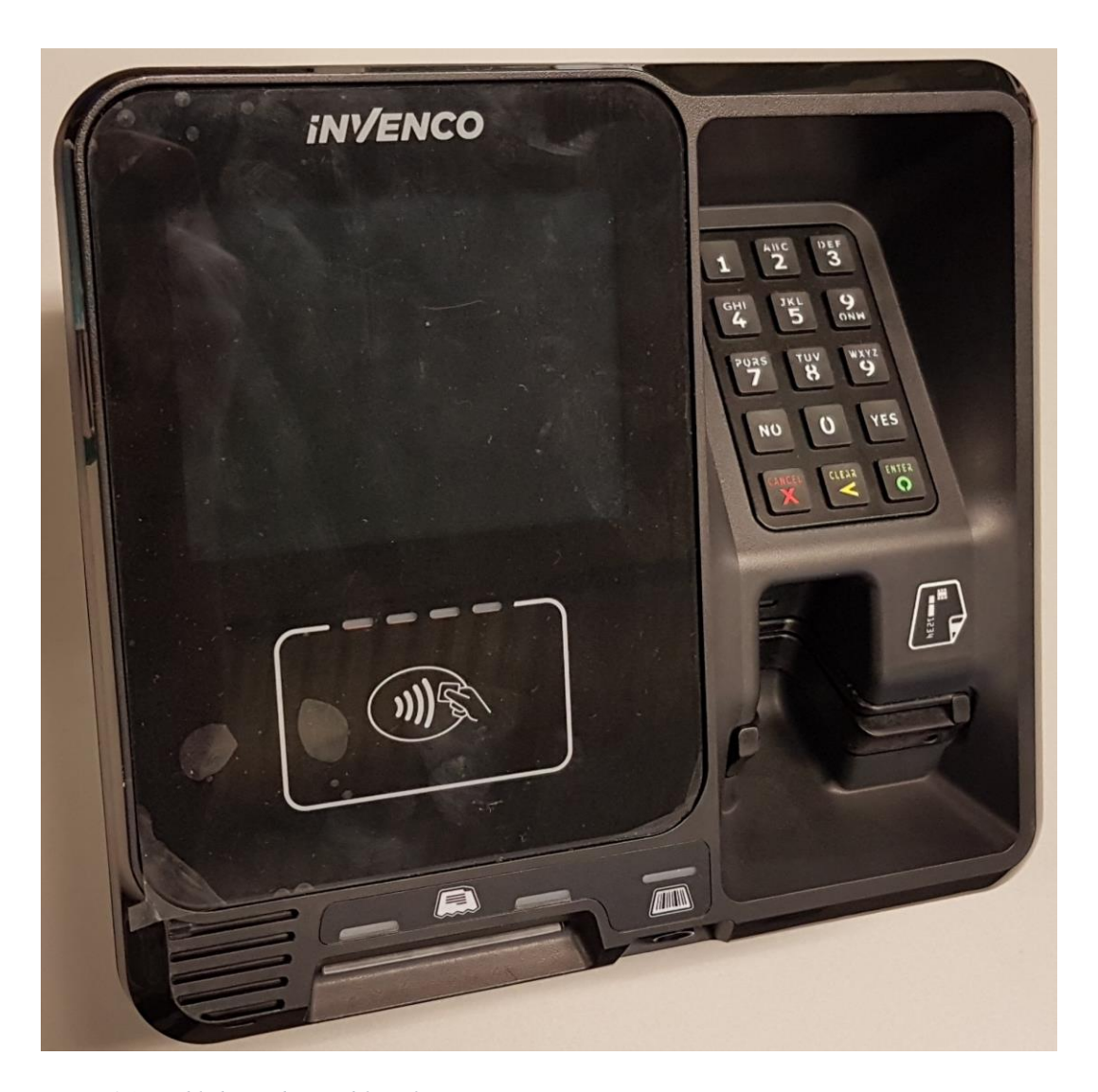
Figure\ 1\ Assembled\ united\ viewed\ from\ front