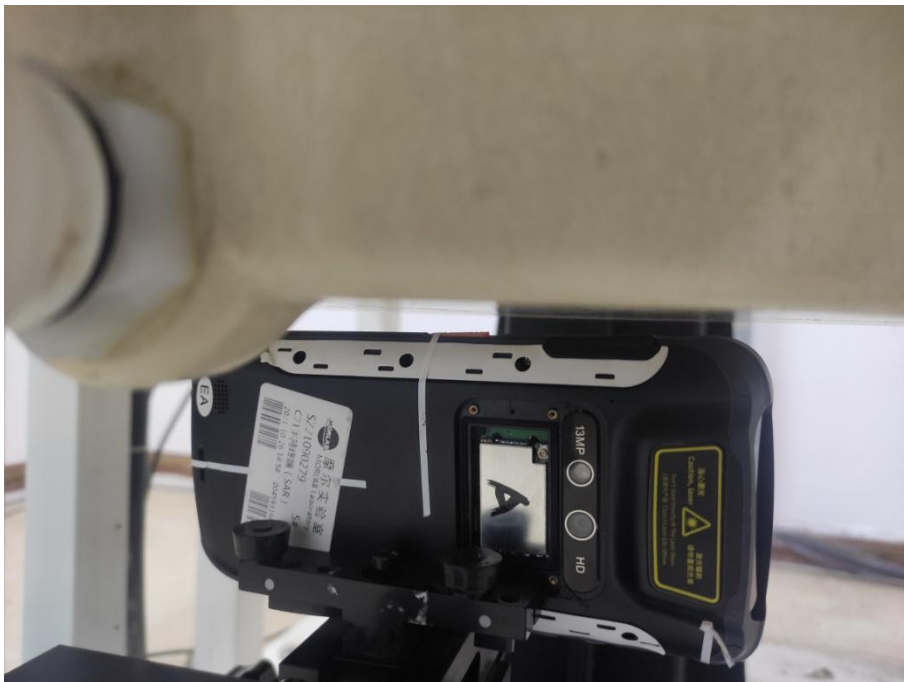
Right Side (Test distance: 10mm)