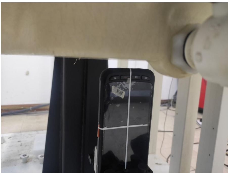
Bottom Side (Test distance: 10mm)