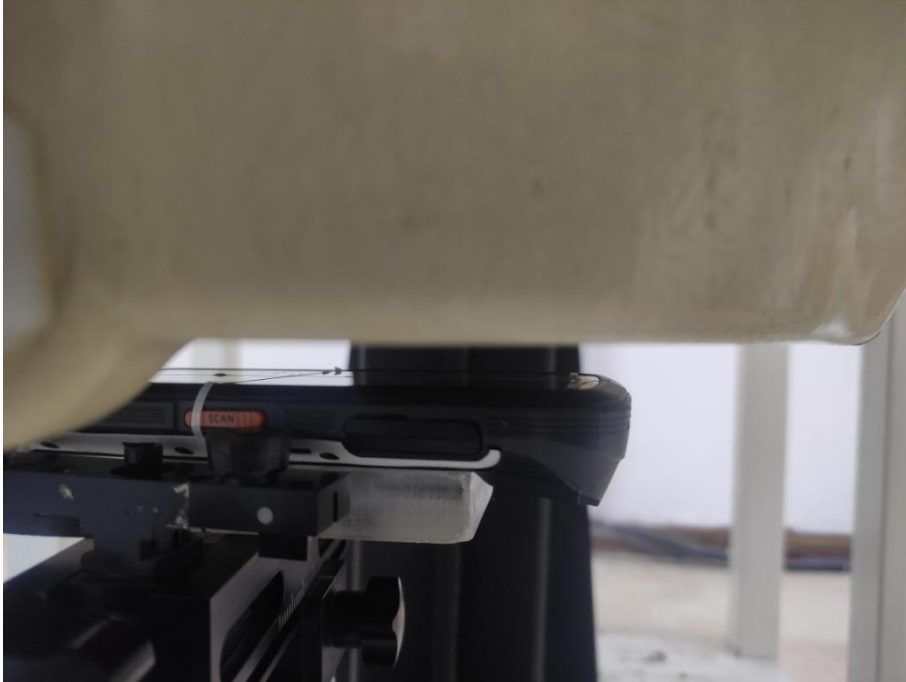
Front Side (Test distance: 10mm)