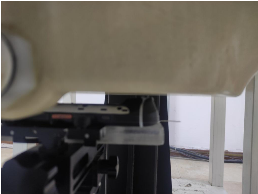
Back Side (Test distance: 10mm)