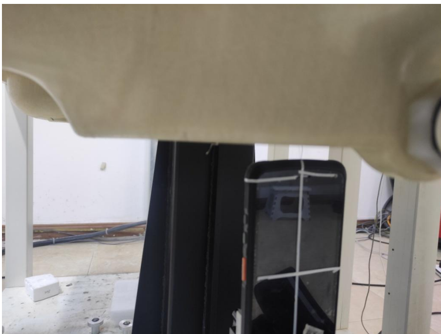
Top Side (Test distance: 10mm)