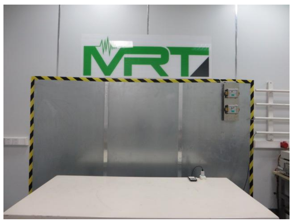
Description: Back view of Conducted Emission Test Setup

Description: Front view of Conducted Emission Test Setup