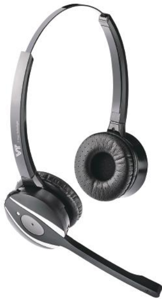
VT9200 BT DUO