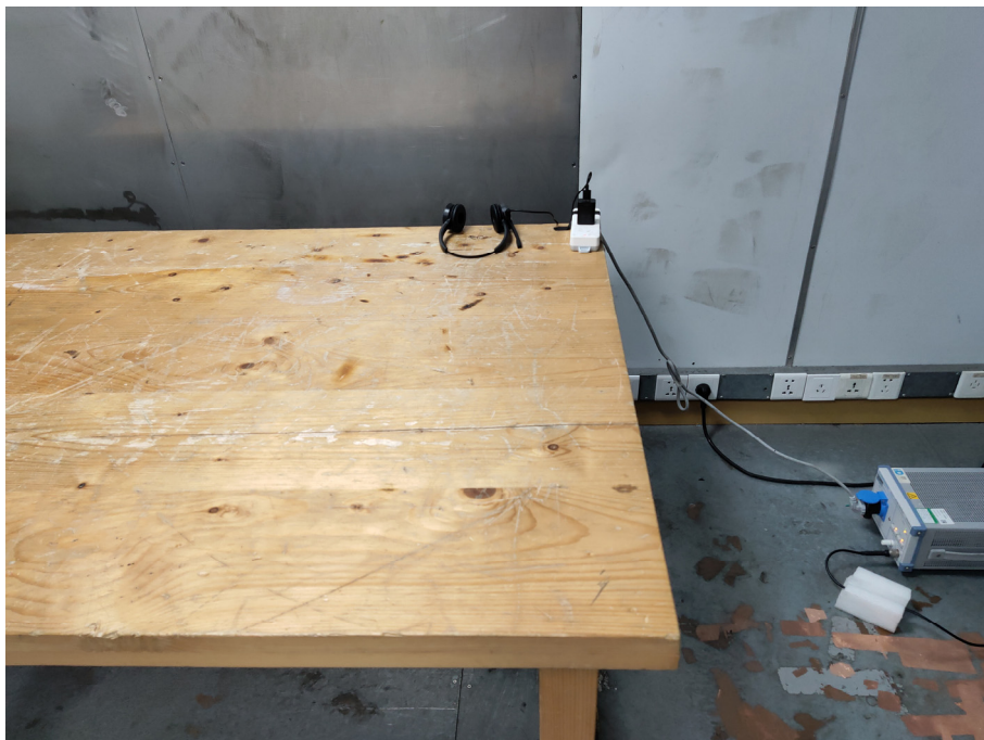
Photo of Conducted Emission Measurement