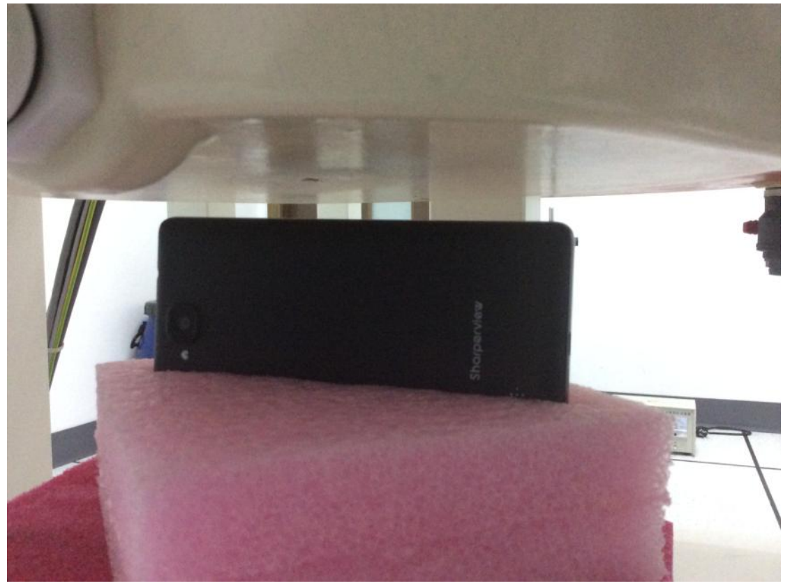
Top with gap 10mm