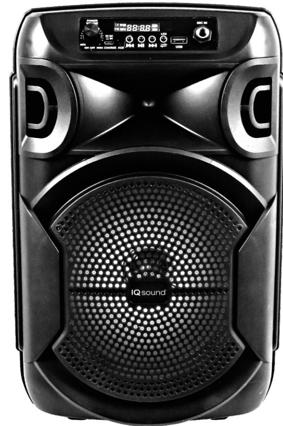
IQ-5308DJBT Portable BT Speaker System