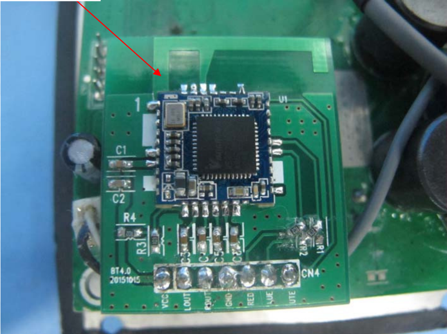
Photo 10 Appearance of PCB