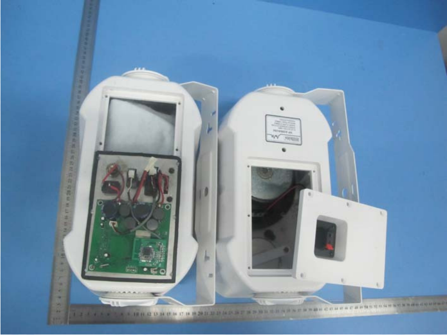
Photo 8 Internal of EUT