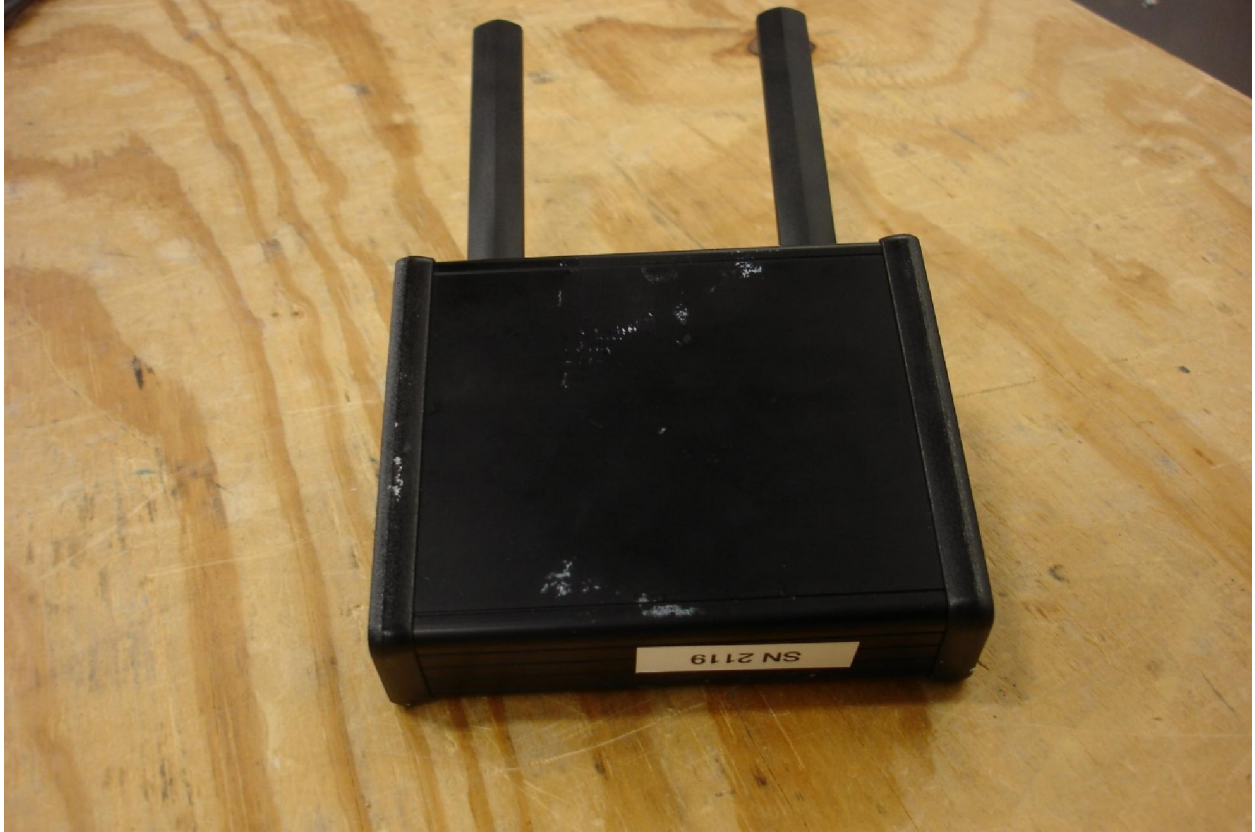
Bottom Side shown (has ICL's Serial Number sticker) and side opposite antennas.