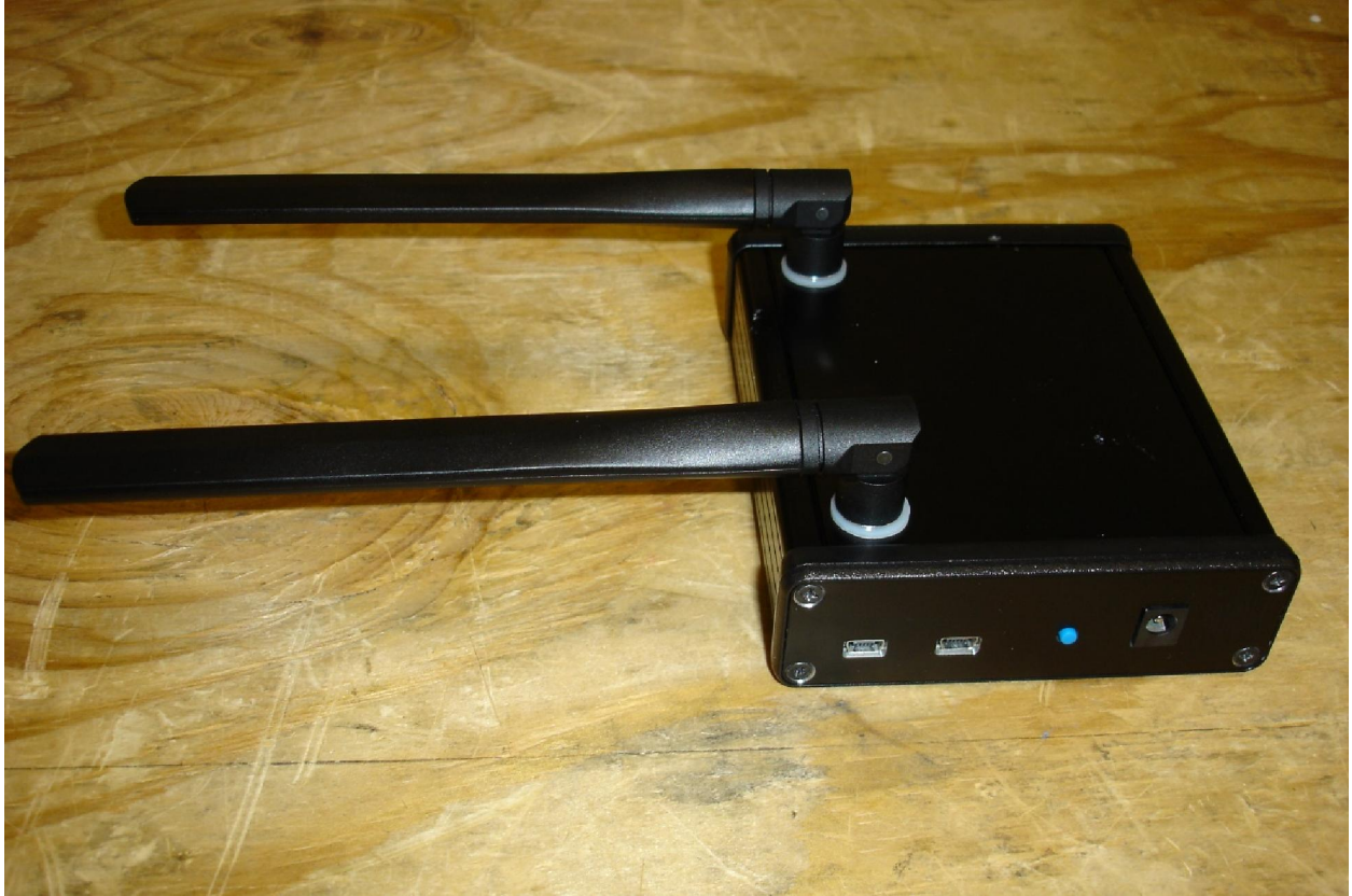
External view of Hub. Two mini-USB ports, button used for linking, and power supply input shown.