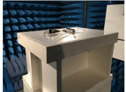
Test setup in anechoic chamber Axis XY