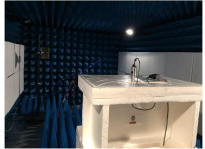
Test setup in anechoic chamber Axis Z