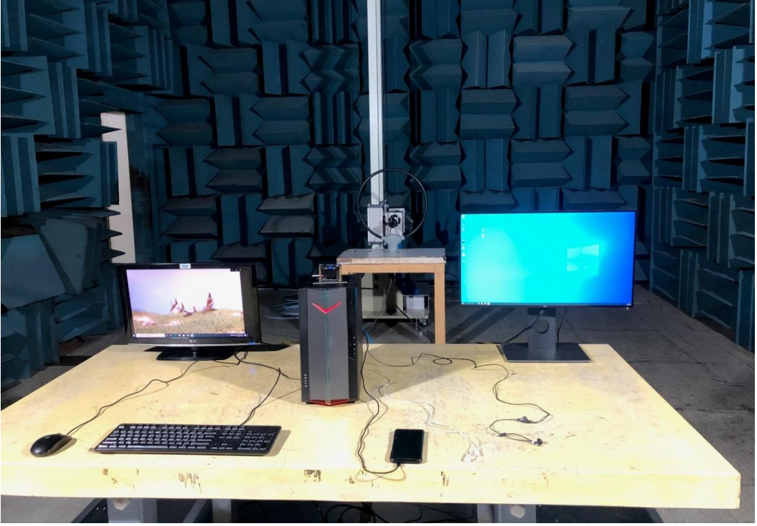
Frequency Range 30MHz to 1GHz

For Host Model: D20E2 Frequency Range 9kHz to 30MHz