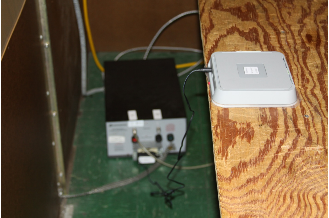
POWERLINE CONDUCTED EMISSIONS TEST SET UP PHOTO