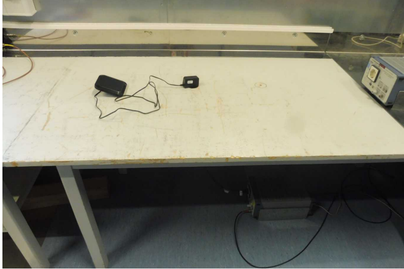
Photo 9 AC conducted