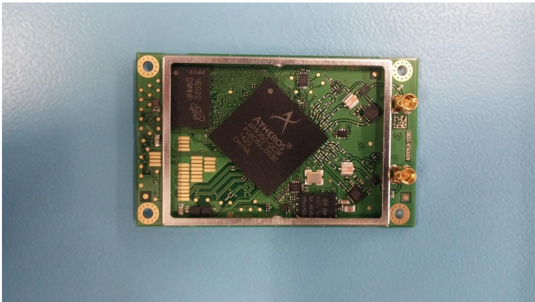
Figure 1: Internal Photo Top-Layer DT60M