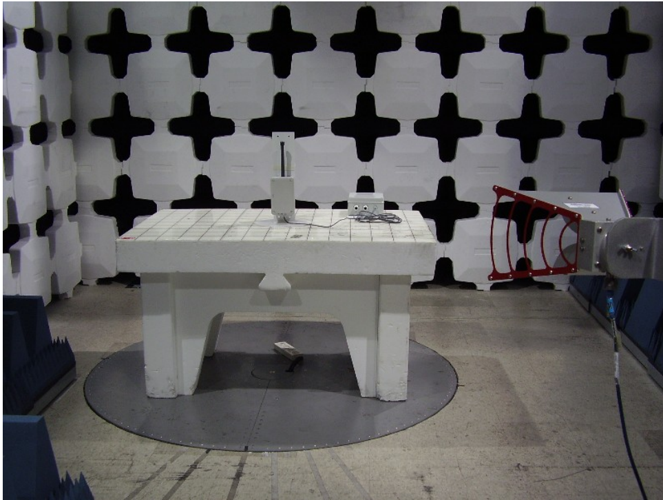
Photo 3. Radiated emissions test.