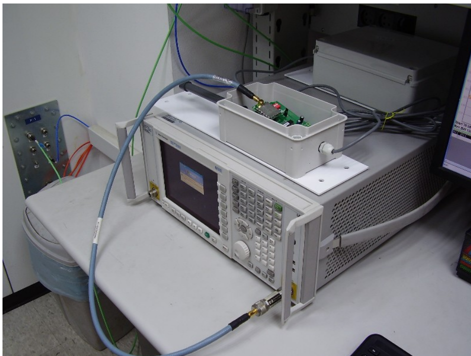
Photo 1. RF conducted emission test.