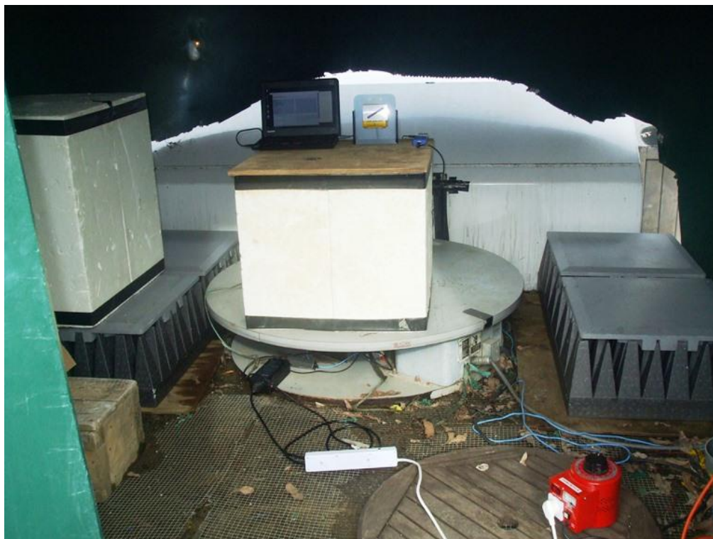
Left hand side