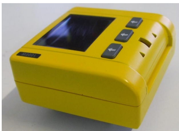
Left hand side view