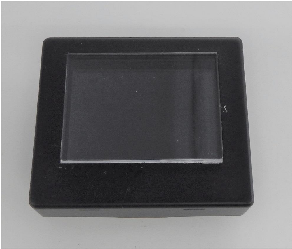
Rear face showing connector