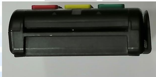
Top Side showing connector