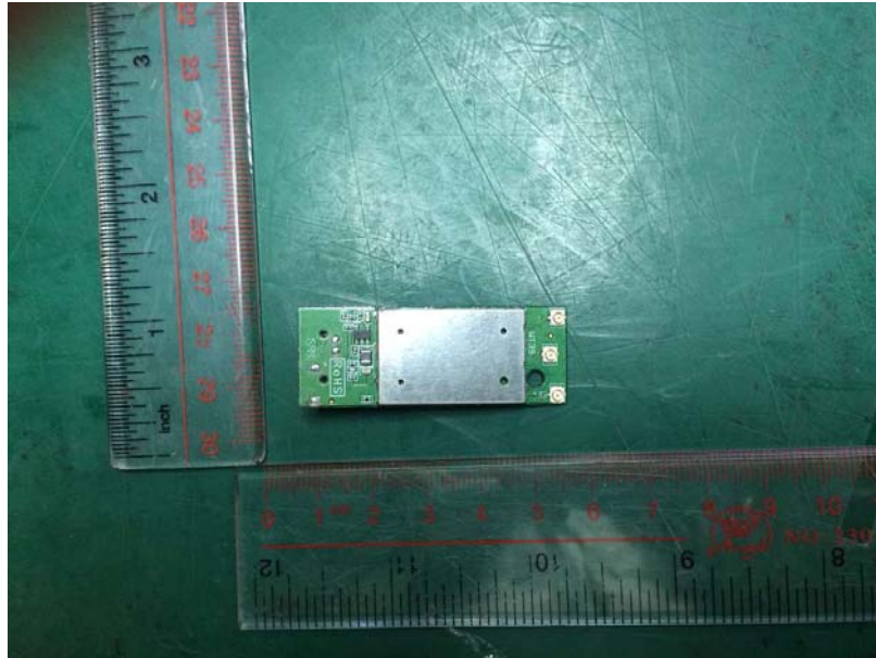
Photo 4 Appearance of PCB