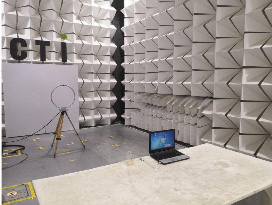
Radiated spurious emission Test Setup-1(Below 30MHz)