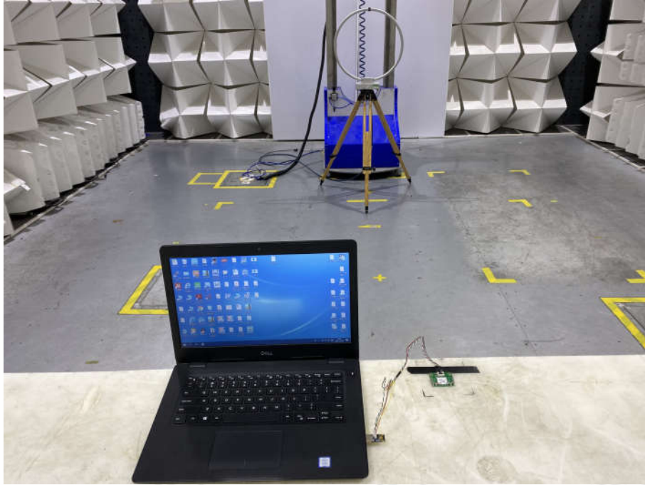
Radiated spurious emission Test Setup-1(Below 30MHz)