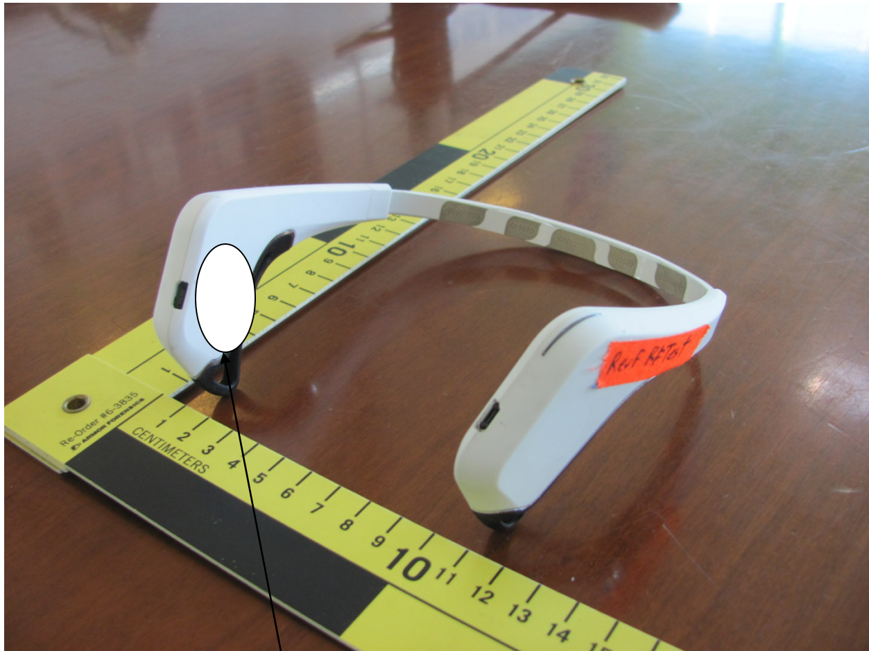
Figure 1: Label location

The label is laser etched onto the enclosure of the EUT.