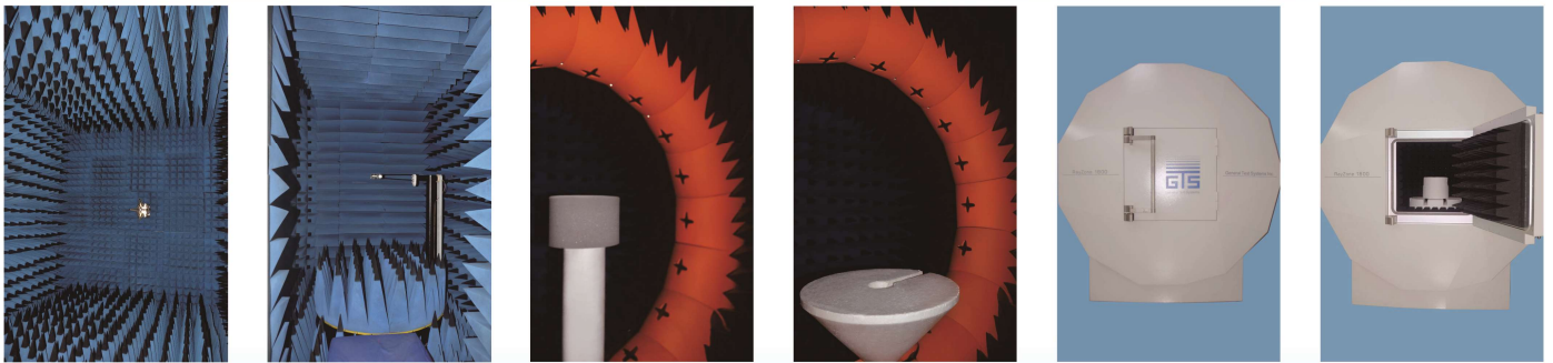
OTA Standard Chamber