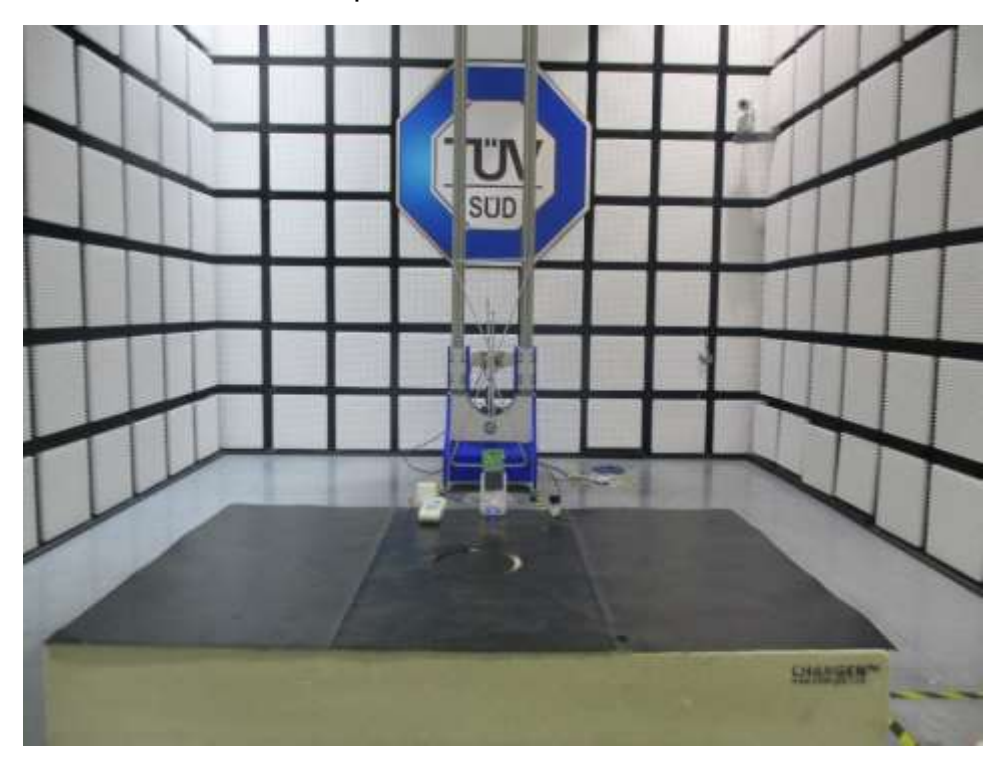
radiated spurious emission 30MHz-1GHz