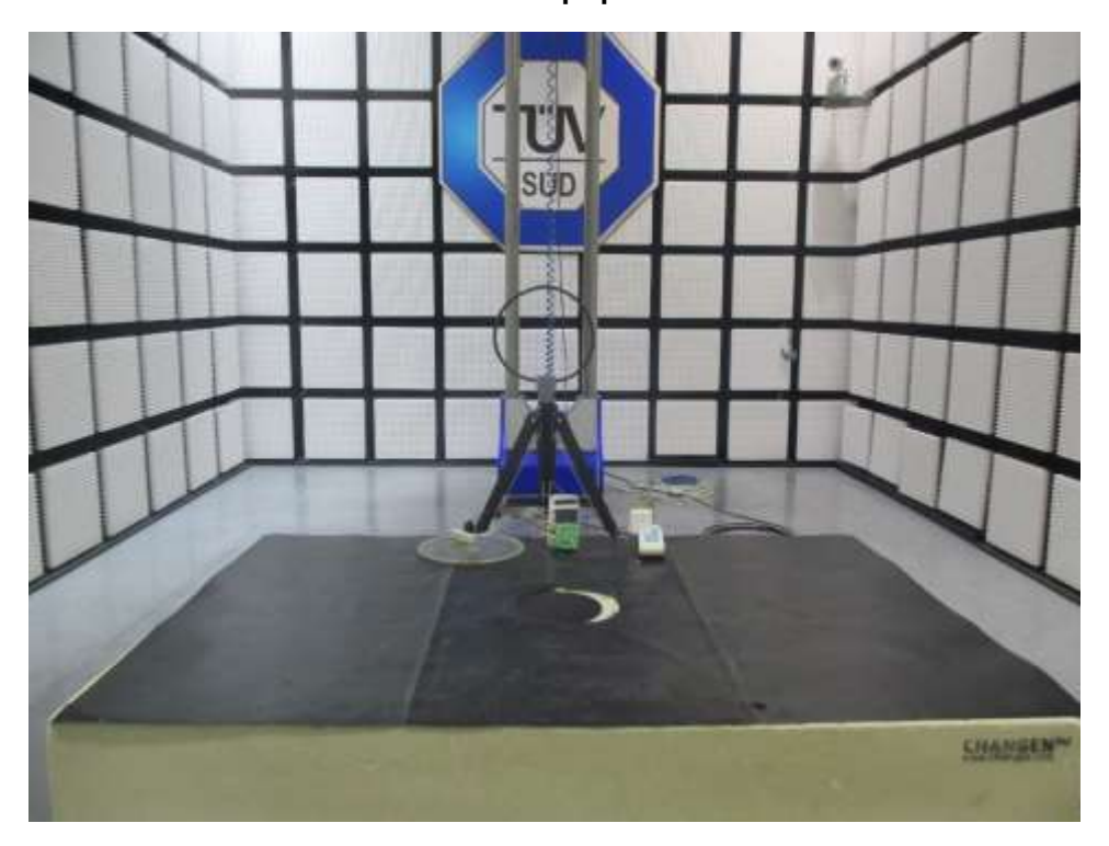
radiated spurious emission 9KHz-30MHz